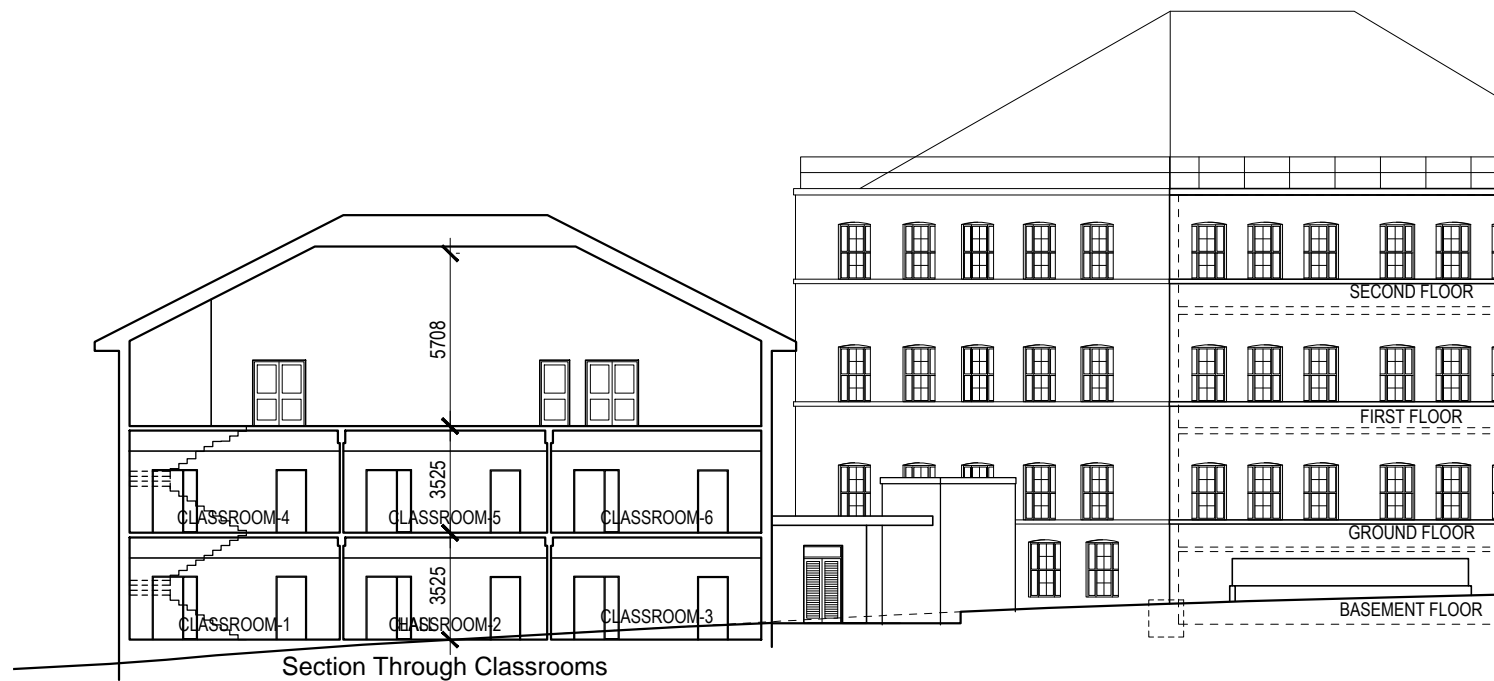
Section Through Classrooms